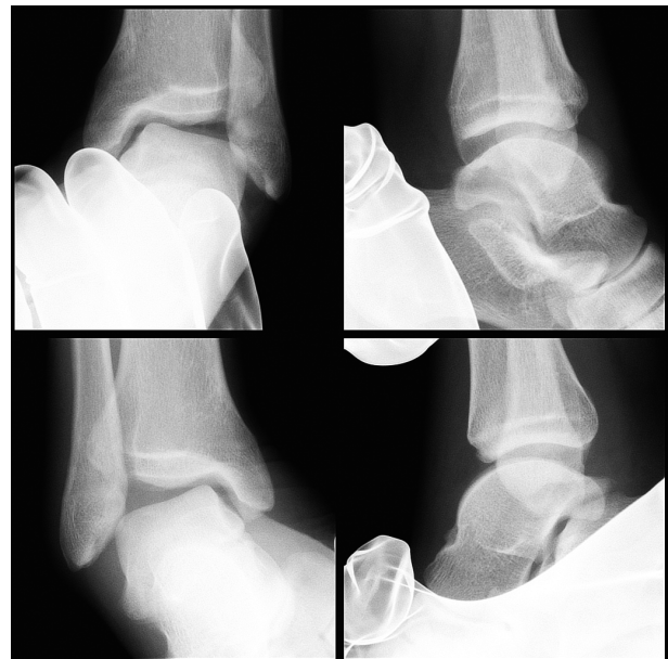
Fig. 4 Stress Radiograph of Ankle Joint

Clinical examples are shown in Fig. 4 and Fig. 5 .