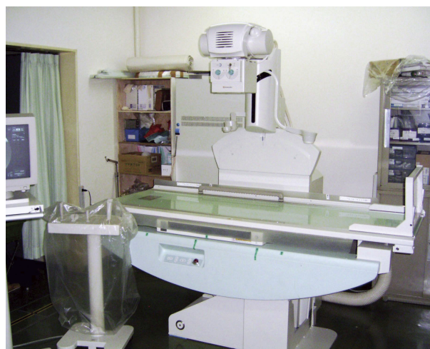
Fig. 1 System Setup

The system is shown in Fig. 1 . The system itself is of an extremely compact design, and requires little installation space. The tabletop does not move longitudinally and so there is no possibility of making contact with items such as endoscopes or shelves, and the movement of operators and caregivers is not restricted.