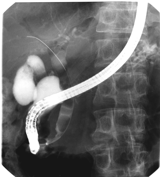
Fig. 7 ERCP