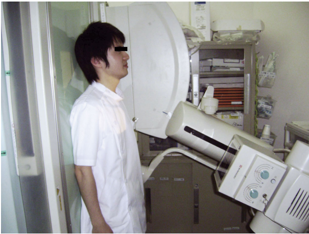
Fig. 3 Clavicle Imaging Performed Using Optional Oblique Incidence Function

The footrest and handrail can be secured in any position, making it easy to perform imaging of the lower extremities in the standing position. When performing standing-position imaging of the lower extremities in this hospital's general radiography room, because of various factors, such as the X-ray tube stroke, it was necessary to have the patient stand on top of a lying-position Bucky table. In the case of elderly or paralyzed patients, there was a significant possibility of the patient falling, and there were many cases in which imaging had to be repeated due to bodily movement.