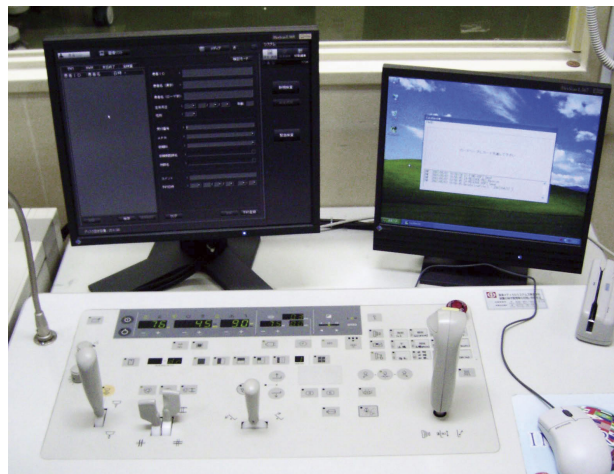
Fig. 2 Remote Operation Console

The local operation console uses almost exactly the same key arrangement as the remote operation console, which makes life easier for the operator.