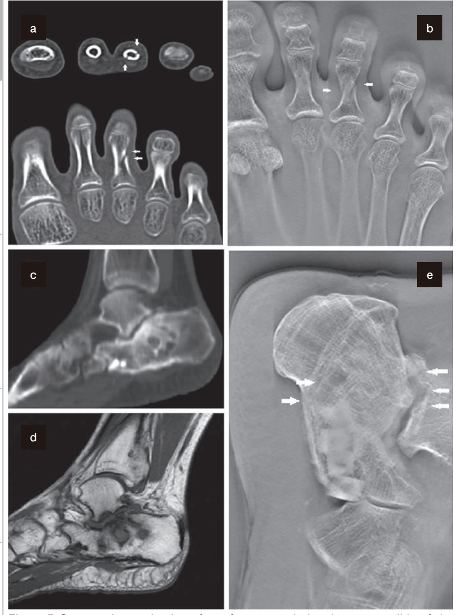
Figure 5 Comparative evaluation of toe fracture and chronic osteomyelitis of the calcaneus

it can be used for radiography of fingers and toes to evaluate chronic rheumatoid arthritis (RA). Although undershoot-type artifacts appear around the metal