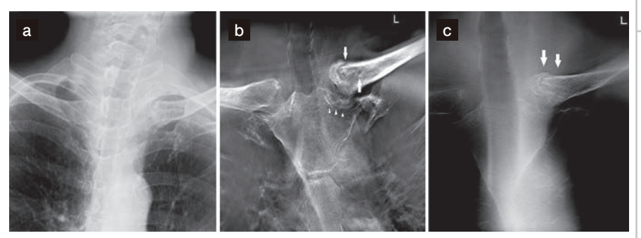
Figure 1 Tomosynthesis of the sternoclavicular joint

17 inches horizontally and vertically, enabling uniform images without distortion even in the periphery. (iii) There is only a little impact of metal artifacts like those seen in CT. (iv) The high contrast and high resolution in direct conversion FPD enables tomographic imaging at high resolution. (v) Although the exposure is at a low dose (twice the plain radiography used in the orthopaedic surgery, around 1/10 of chest CT screening), a high-precision tomographic images can be obtained. (vi) Tomographic images can be obtained in any position (standing, supine, tilting), while applying a burden to the observation area. (vii) The process requires a short time from the patients, and also a short time for patients to retain the position, thereby significantly reducing patient discomfort. Also, throughput is at an adequate level. (viii) Image checking is simple, and the patient examination efficiency has been improved dramatically.