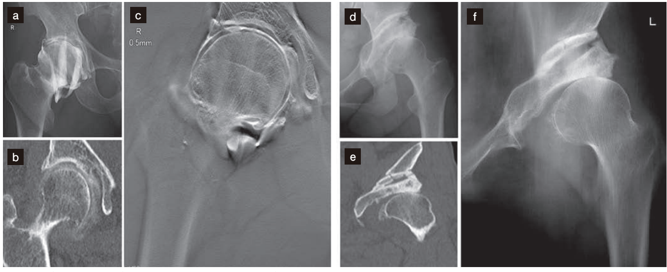
Figure 4 Comparison of hip joint tomosynthesis and CT

In this hospital, we set specific and original protocols for individual examination items, imaging technique and region at the lowest level of exposure required. Tomosynthesis is a examination method most suitable for the observation of fine displacement or fracture, callus or dissolution, state of bone union and the boundary between the artificial and natural bones, all of which is difficult to be visualized by plain